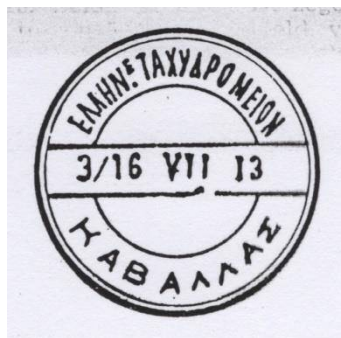
Variant I, Stage II