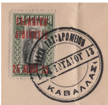
Variant II, Stage I