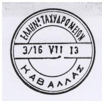
Variant I, Stage II