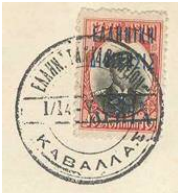
Variant I, Stage I