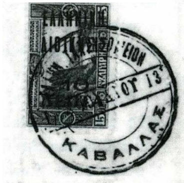
Variant II, Stage II