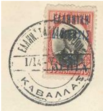
Variant I, Stage I