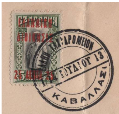
Variant II, Stage I