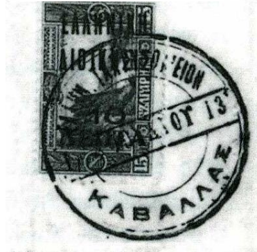
Variant II, Stage II