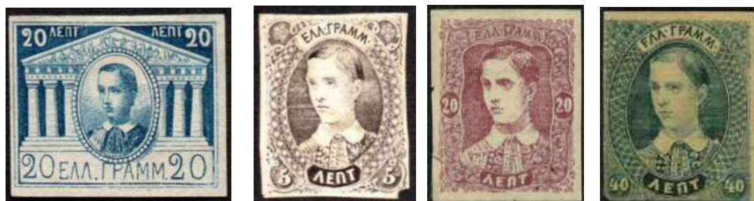
Fig1a and 1b-d: Type I and type II of the essays

When you buy a mixed lot of Greek stamps at an auction now and then, or scroll through stock books with surplus stamps, you will probably have seen them, those brightly coloured imperforated stamps with the image of a young man and the facade of a temple. These are called the "essays" of King George I of Greece. The Vlastos catalogue lists them (Vlastos 2012, U1 and U2). I will hereafter refer to them as essay type I. In addition, a second variety is listed in the catalogue (U3-U5) with the same young man, but now without the image of a temple. I will refer to them as type II. The Vlastos catalogue indicates that both these types of stamps are "unofficial Issues".