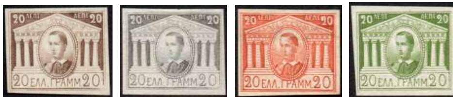
Fig.5a-d: Examples of type I