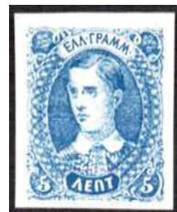
Fig.13: Type II, 5 lepta, coarser print on thick white paper

For the sake of completeness I must mention that Bill Ure (and Louis Fanchini) also name a few clearly identifiable and very crude forgeries of both type I and II. It is interesting to note, a forgery of type I is already mentioned by Arthur Maury in his "Le Collectionneur de Timbres-Poste" of September 1864. He states: "The Greek Essays, representing the new King and the Parthenon, have been roughly forged by copying them. Mister B. from Le Havre, please be careful!"