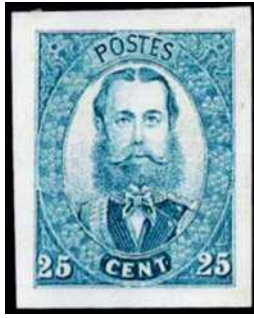
Fig.6: Essay for Maximiliaan of Mexico