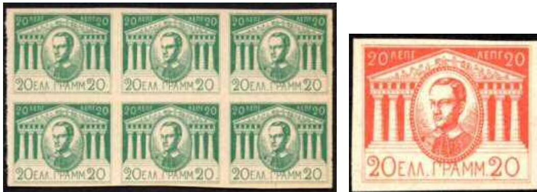
Fig.12a-b: Two examples of type Ic

Whole sheets of this variety were offered for sale at EBay in the past years, showing that they were printed in large sheets of 11x10 stamps. This type Ic (printed in eight colours), is the one most offered on the philatelic market, in singles, pairs, and large blocks.