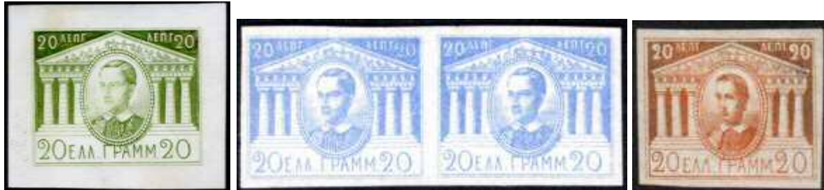
Fig.9a-c: Type Ia and Ib and a copy of type I for comparison

Glasewald starts off with a new version of the essay of type I. In this version, the king has a broader head, the locket is a bit wider and lower, and the columns of the temple of the Parthenon look more solid. Of this variety he mentions a copy in steel engraving on white paper, which he knows only in blue, and a lithograph version in up to 16 colours. I will refer to them as type Ia (white paper) and type Ib.