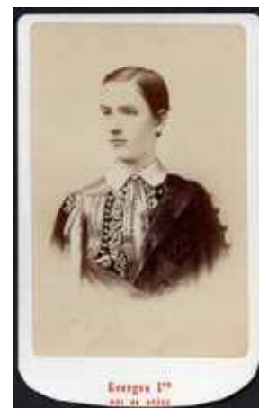
Fig.2 The portrait of the young King used as an example for the “essays”

With regard to the stamps of Greece, philatelists had high expectations for a change due to the arrival of the new king. Jean-Baptiste Moens, the famous Belgian stamp dealer and one of the founding-fathers of philately, wrote in his journal “Le Timbre Post” as early as April 1863 regarding the arrival of Prince William to Greece: "The acceptance of the Crown of Greece by Prince William of Denmark, which seemed a fact, is again not certain. This is not without significance for collectors,