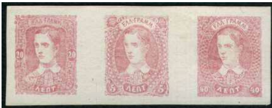
Fig.8: Ronchi essays, type II

The designs of the latter show striking similarities with the essay of type II of Greece. The frames used, the colour and the printing of the essays in sheets, in my opinion form sufficient evidence to believe that Luigi Ronchi is also the designer of the essay of type II. He was a printer in Milan in the middle of the 19th century, editing prints, maps and guides. He was also publisher of, amongst other things, patriotic books and pamphlets.